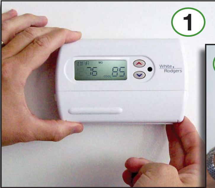
1. Remove faceplate from lower right corner.