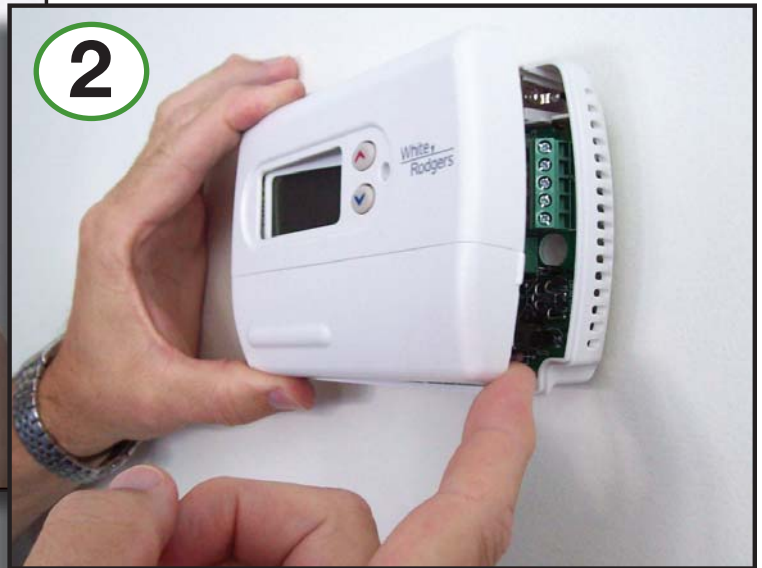
2. Side view of faceplate removal.