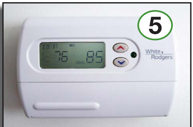
5. Snap faceplate back into place.

Residential Customers 1.866.838.6918 Non-residential Customers 1.866.800.0747